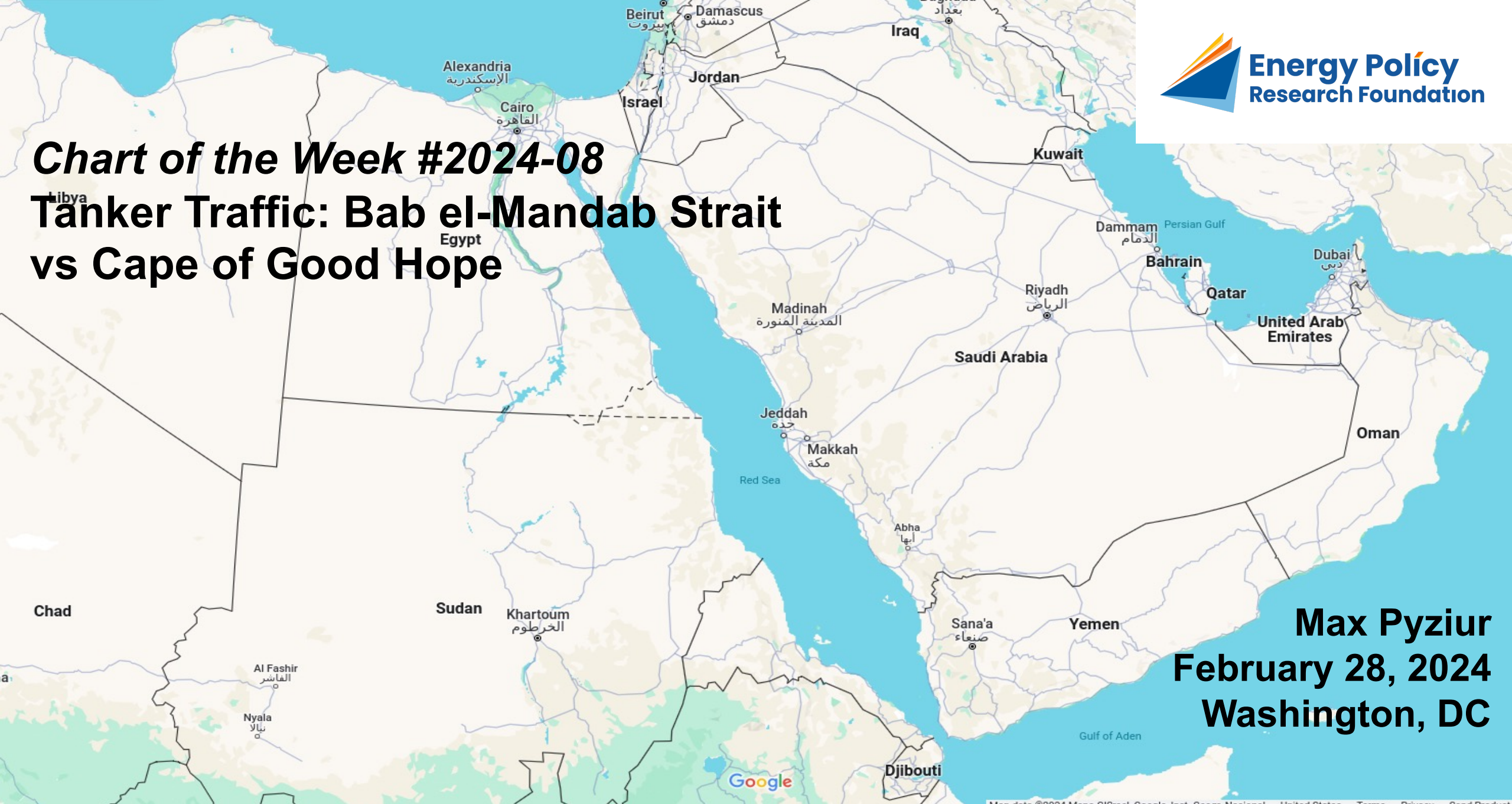
Chart of the Week #2024-08 Tanker Traffic: Bab el-Mandab Strait vs Cape of Good Hope

Max Pyziur February 28, 2024 Washington, DC