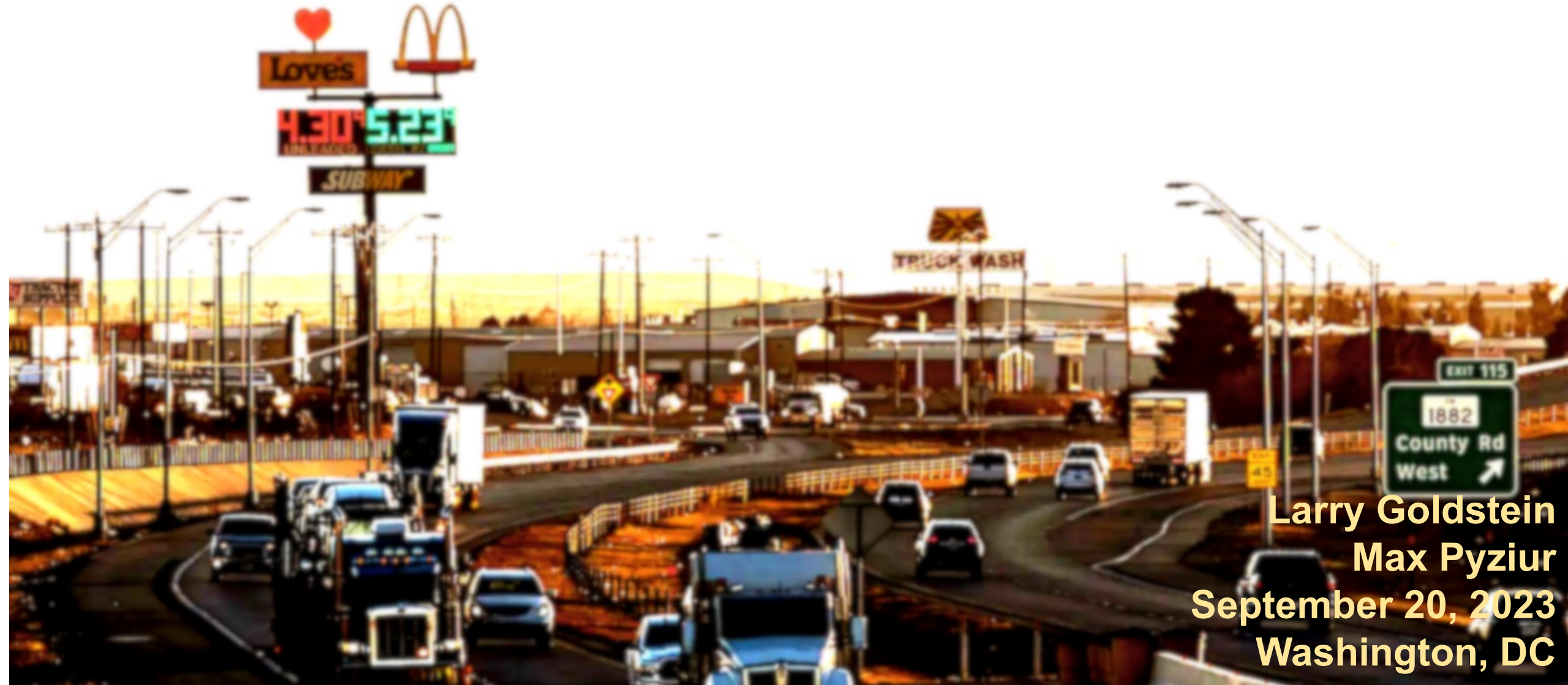
Chart of the Week #2023-36 Rising U.S. Transportation Fuel Prices

Larry Goldstein Max Pyziur September 20, 2023 Washington, DC