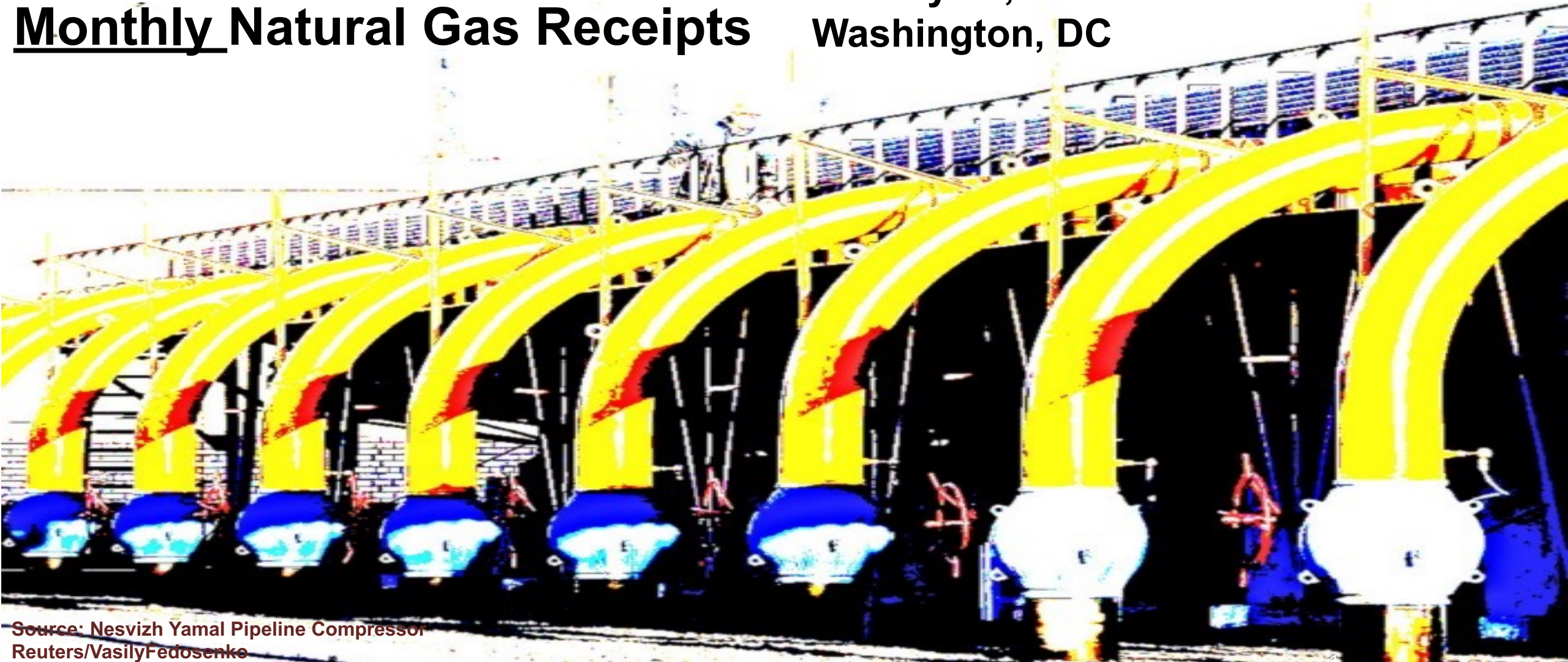
Source: Nesvizh Yamal Pipeline Compressor